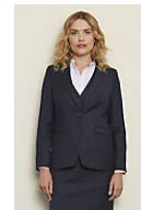
NEOBLU MARIUS WOMEN 03165