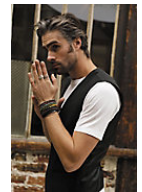
NEOBLU MAX MEN 03166