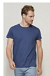
SOL'S CRUSADER MEN 03582