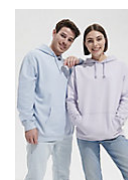
SOL'S CONDOR 03815